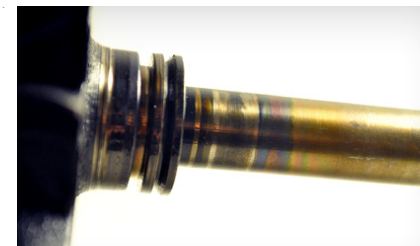
High temperature and material transfer to bearing

Turbo fatigue cracking and material transfer created by metal to metal friction and high temperatures as a result of oil inlet supply restrictions, incorrect gasket placement and use of liquid gaskets or poor quality lubricants.