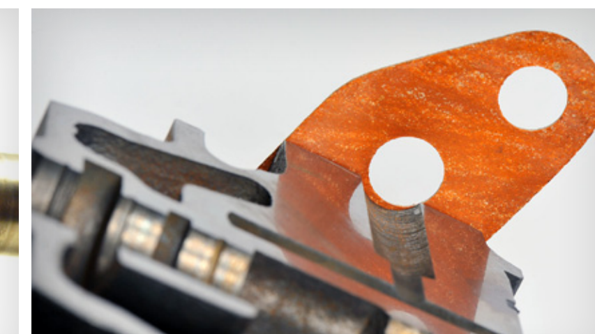
Incorrect shape and position of gasket