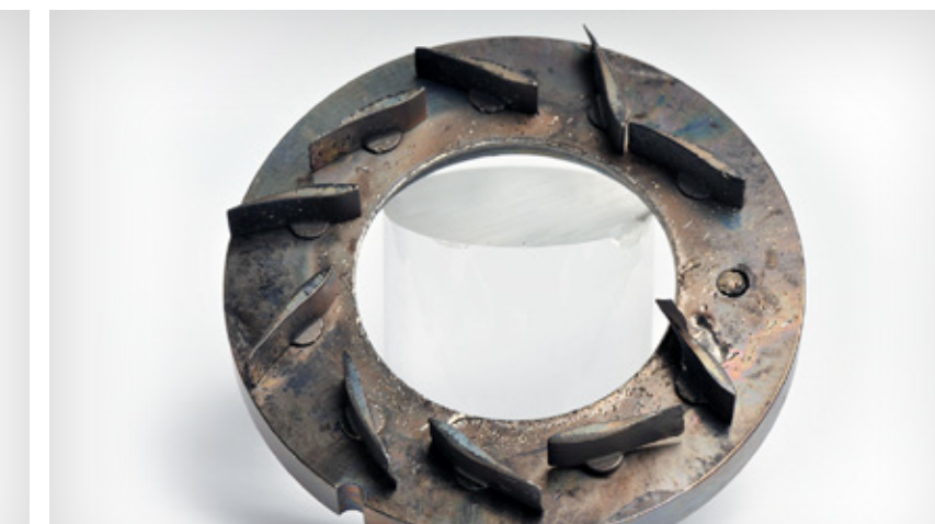
Damage to a nozzle assembly