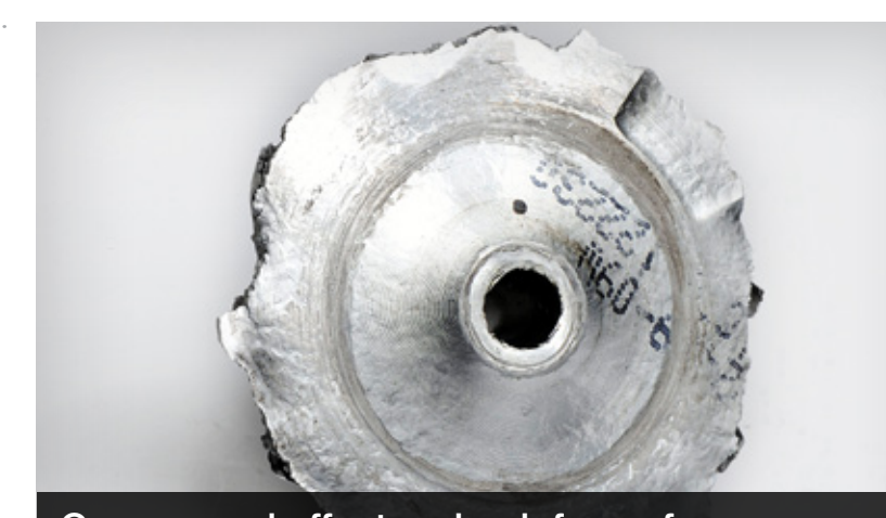
Orange peel effect on back face of compressor wheel is a clear sign of overspeeding

Turbo damage caused by working beyond its designed parameters or outside the vehicle manufacturer's specification. Maintenance problems, engine malfunction or unauthorized performance upgrades can push turbo rotating speeds beyond its operating limits, causing fatigue failure of compressor and turbine wheels.