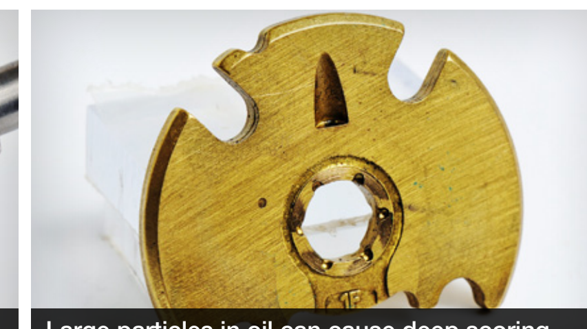
Large particles in oil can cause deep scoring and impacts