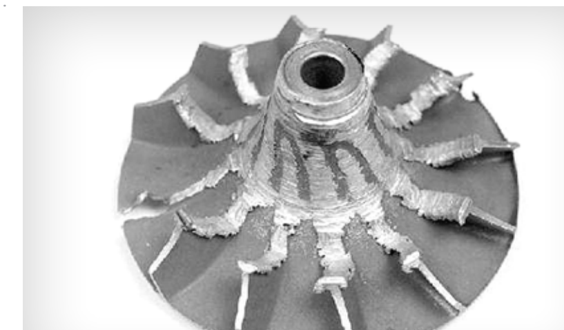
Damage to a compressor wheel

Turbo wheel and/or variable vane damage, caused by small objects entering the turbine or compressor housing at high speed, leading to vane movement restriction and wheel imbalance.